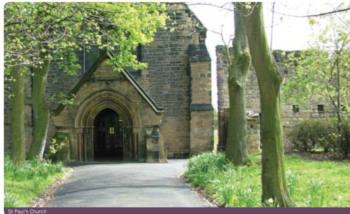
St Paul's Church