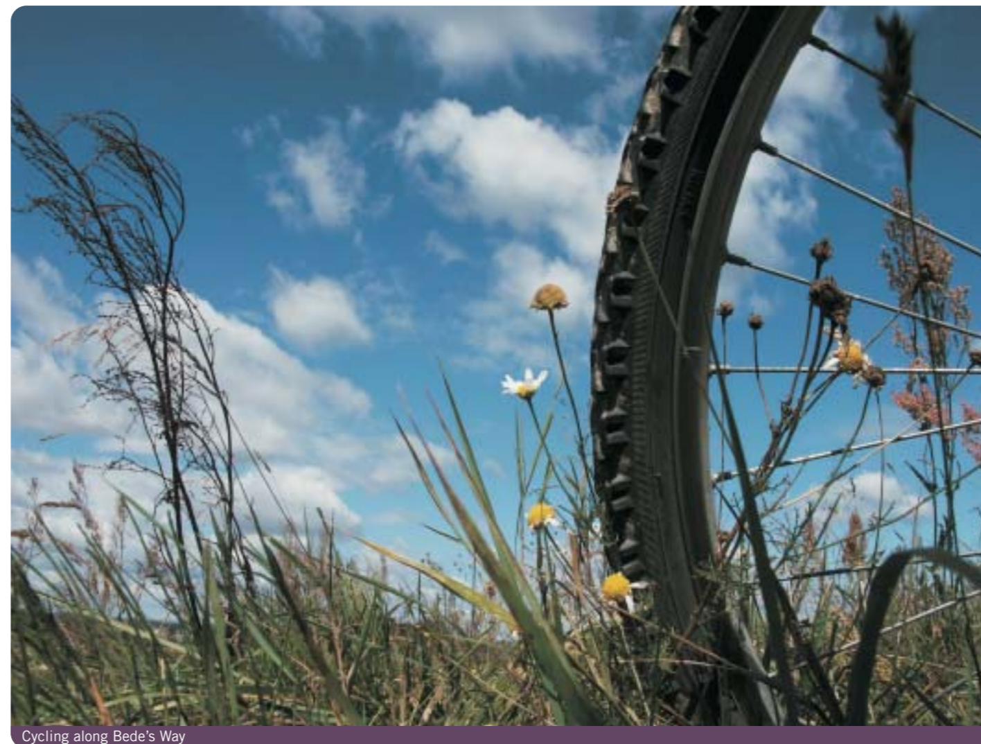
Cycling along Bede's Way

To explore our countryside, coast and culture visit the Great North Forest.